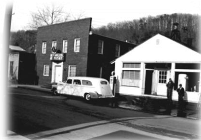
Ice House on the far left of the photo