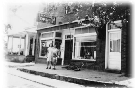
Jennings Drug Store

I met lots of good and wonderful people while performing in my little white jacket and cap to match. What an experience to hand a four or five year old child a “double dip” ice cream cone and to watch their eyes light up, and for only 10¢.