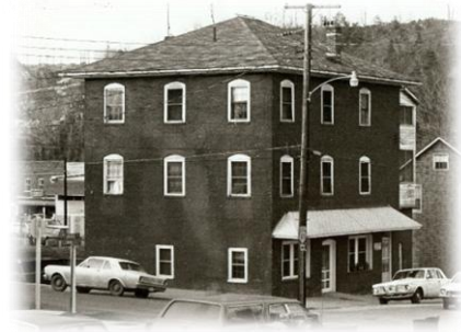
Garner House or Hammill Hotel

On Sunday afternoon we often sat on the upper porch of The Gardner House to watch the cars go through town. We tried to see how many out-of-state cars we could count. Another exciting event was when the traveling shows would come to town. They would put up a large tent on the "flats" by the river in front of where the the post office is now. Everyone from all around would come to see the performance.