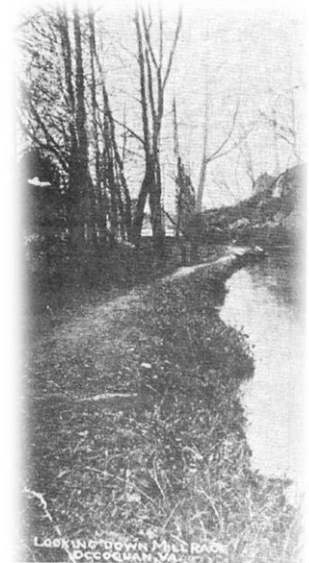
THE OCCOQUAN - The water holding tanks now occupy this spot shown at the turn of the mill race.